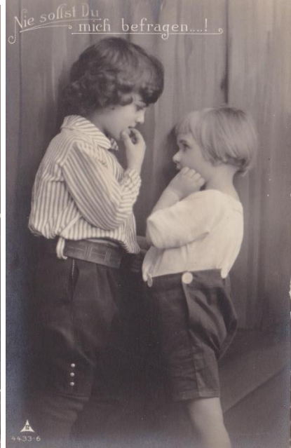
WSSB 930 (Wilhelm S. Schroeder Nachfolger, Berlin), numbers 1, 4 & 6