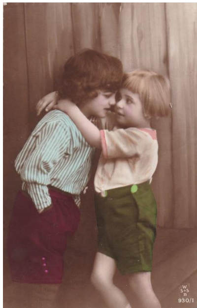
While different photos, these appear to be from the same photo shoot as Photochemie 4433.